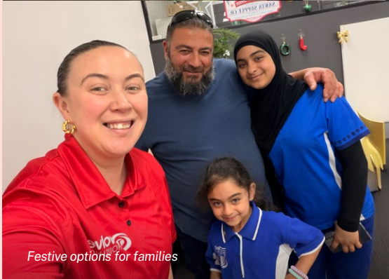
Festive options for families