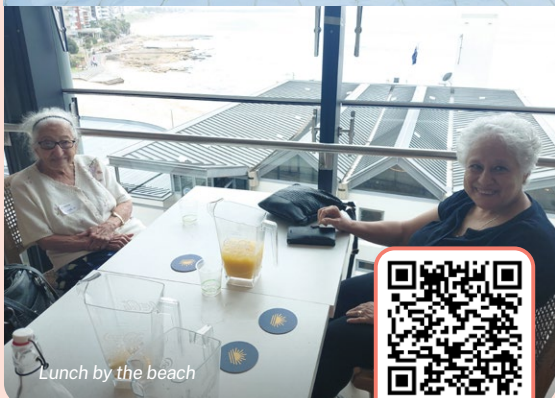
Lunch by the beach