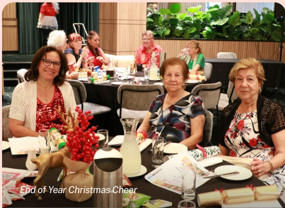
End of Year Christmas Cheer

At Evolve Housing, we love bringing residents and their families together through fun, inclusive community events. From celebrations to workshops, there's always something happening.